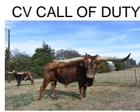
CV CALL OF DUTY