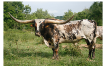
CV COWBOY CASANOVA