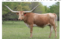
ABBY BANDITA BCB