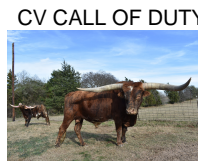
CV CALL OF DUTY