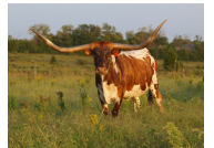
FL RIO MAXINE